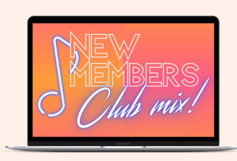
Click images to see more.

The CLUB MIX is a fortnightly lesson where you'll learn basic technique, theory & foundational keyboarding skills to get you through the basics and onto the fun stuff in just 10 weeks!