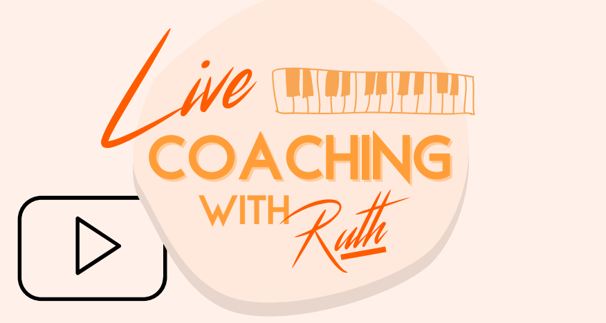
Click images to see more.

Because you're a pro at the technical, you'll want to pick and choose which sessions you join – but even my most advanced pianists who've been playing for 10+ years always manage to find something new by keeping a 'learner's mindset'.