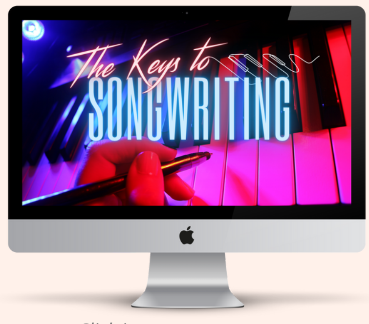
Click images to see more.