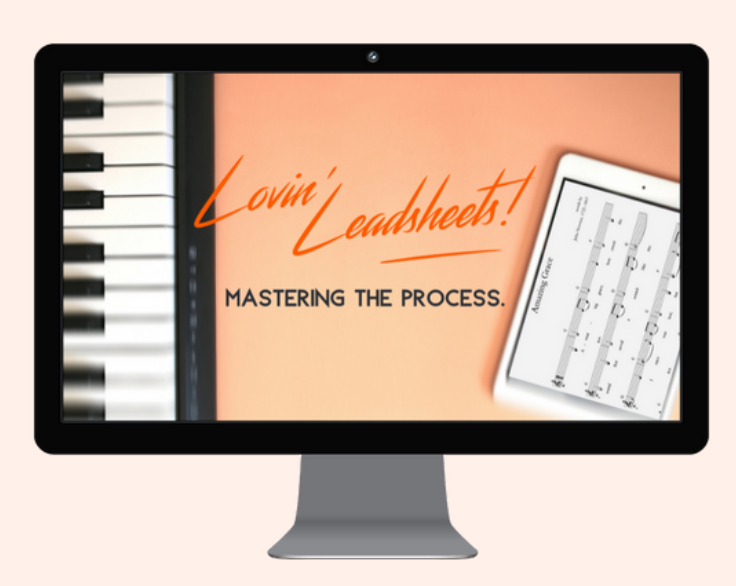
Click images to see more.

A leadsheet is a short-hand version of sheet music, learning to interpret them means a quicker, easier way to learn songs and make a creative piano arrangement of your own!