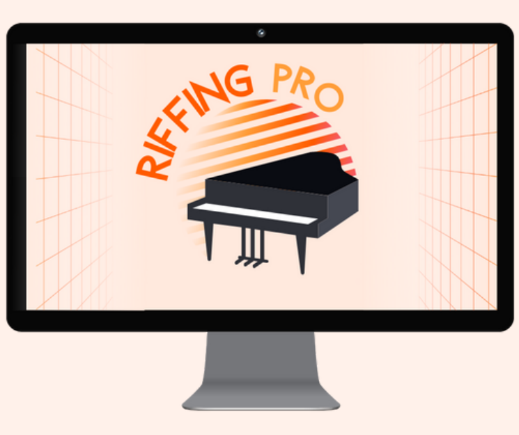
Click images to see more.