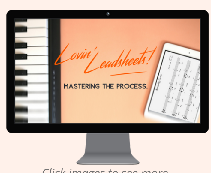
Click images to see more.

A leadsheet is a short-hand version of sheet music, learning to interpret them means a quicker, easier way to learn songs and make a creative piano arrangement of your own!